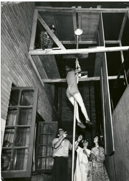
Life Magazine picture of Fireman's Fling party.

too hot to handle and it flew out of his hands, cleared the edge of the roof, and shattered into a million pieces on the yard below. Jim's dad survived to tell the story.