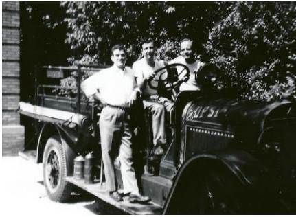
Original fire truck.