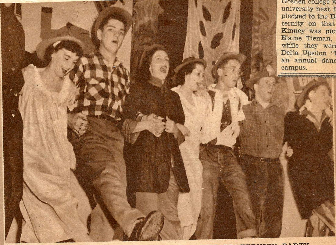
A SEGMENT OF A SINGING CIRCLE AT THE FRATERNITY PARTY. NEXT WEEK: SWEET BRIAR COLLEGE, SWEET BRIAR, VA.